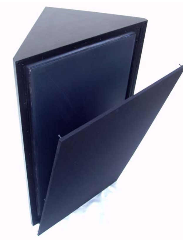
The Dimension4 SpringTrap. Notice the gasket-sealed diaphragm behind the removable grille.

SpringTrap is 46"x18"x18" and it can be painted to any color.